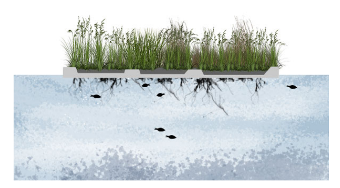
Figure 2: Floating raft of remediation plants (A. Nyka).

To respond to these issues, students searched into the former lines of canals, moats, brooks and other water reservoirs, and then, creatively reinvented them, adjusting their forms to the actual urban, environmental and social context. The study was divided into several phases. In the first stage, students delved into water management and environmental engineering issues, recognising basic objectives, processes and infrastructures. In the second phase, they investigated historical maps of Gdańsk and layered them against a contemporary map, analysing dynamic processes of relocation of urban waters. In the next phase, they searched for areas where referring to the historical waterways would be beneficial, taking into consideration the morphology of urban space; the possibility of implementing climate adaptation concepts; ecological potential and socio-cultural attributes of analysed areas. Subsequently, students identified territories where the recovery of historical waterways would be feasible and beneficial for the city. Then, they developed individual concepts referring to historical water contours, but proposing necessary changes and modifications to adjust the new layout to the existing city structure, social expectation, water management issues and ecological objectives (see Figure 1).